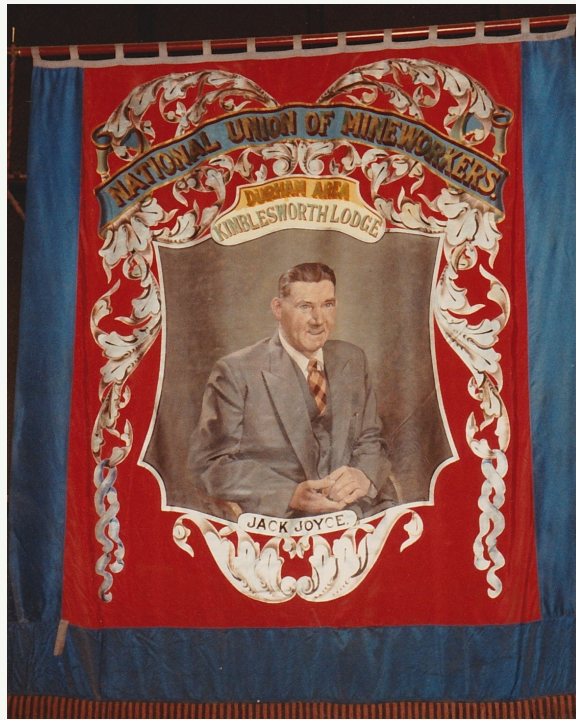
The third Kimblesworth banner was purchased and amended circa 1960, replacing 'Ushaw Moor' with 'Kimblesworth'.

Pictures of our Parish Do you have any interesting, new or old, pictures of our parish? Would you be happy to share them with us and other members of our parish? If so please send them to our clerk (contact details on front page).